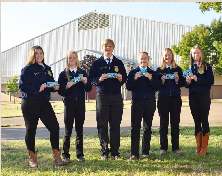
Santiam Christian FFA Chapter helping with Summer Tour